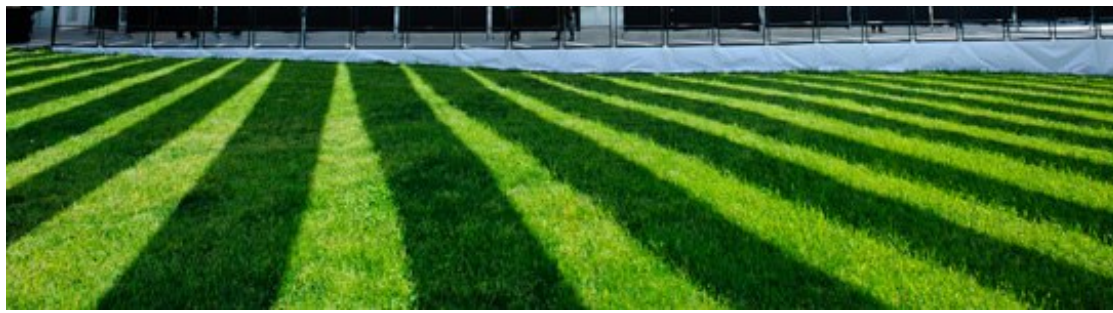
The dramatic Frieze tent, designed by SO - IL, on New York's Randall's Island.

This past week, Frieze New York returned to Randall's Island for the art fair's second Stateside edition, once again luring collectors, curators, and other culturati across the East River to the event's snaking tent, designed by SO - IL . Inside, more than 180 of the world's leading galleries staged displays—the most exhibitors in Frieze's history and clear proof that the U.S. adaptation of the London mainstay was not, as some naysayers suggested, a one-hit wonder.