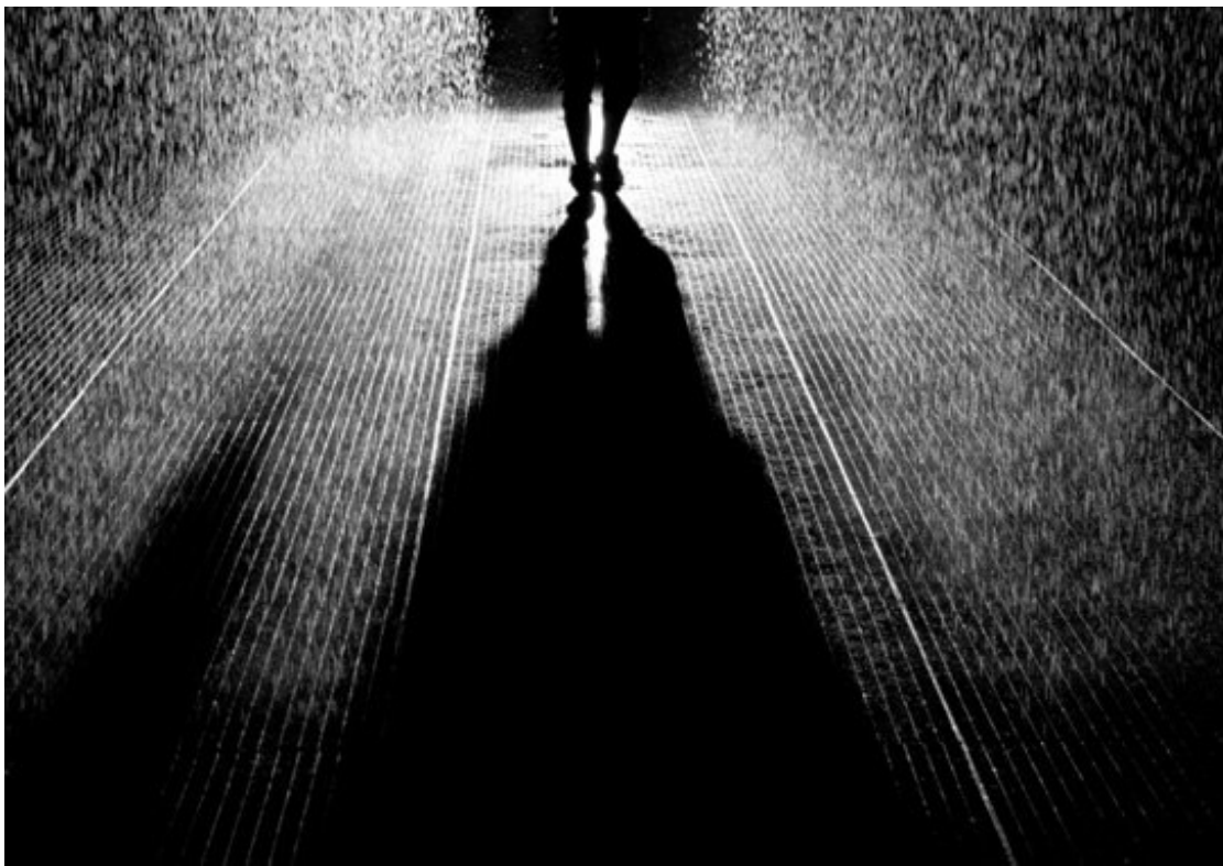
Rain Room (2012), by Random International, at MoMA.

These past few days, anyone in the art world almost certainly felt overextended. After all, Frieze was just one stop on a long list of can't-miss events. Friday night, the Museum of Modern Art revealed its presentation of Rain Room —a cutting-edge wonder by the British design firm Random International that allows participants to walk through a man-made storm while remaining perfectly dry. (J.Crew creative director Jenna Lyons and her son were first in line to see the extraordinary piece.) Downtown, meanwhile, Pace toasted its first exhibition of work by Japanese artist Yoshitomo Nara at a glittering party atop the Standard hotel. On Saturday, people flocked to see that show and other gallery spectacles, chief among them the dueling unveilings of Jeff Koons's latest at David Zwirner and Gagosian . Other highlights included Paul McCarthy's simultaneous shows at both Hauser & Wirth outposts, Wolfgang Tillmans's exquisite photographs at Andrea Rosen , and new work by the Cuban collective Los Carpinteros at Sean Kelly .