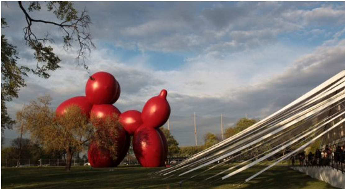
Balloon Dog (2013), by Paul McCarthy, presented by Hauser & Wirth.