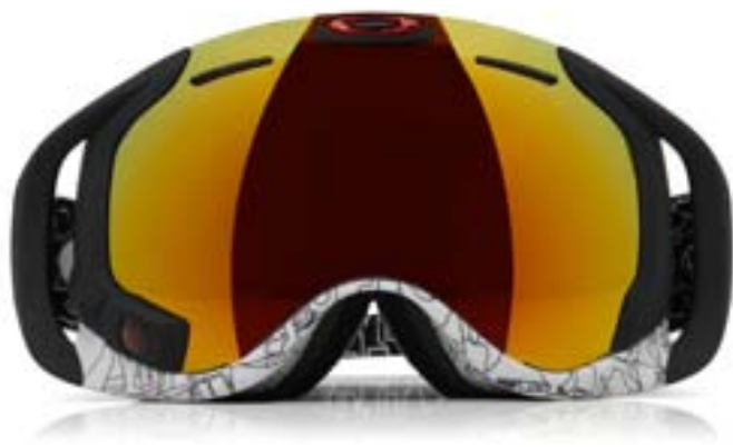
oakley airwave HUD + GPS goggles