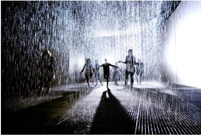
a pixelated grid of 25cm x 25cm panels controls nine outlets of water image © felix clay