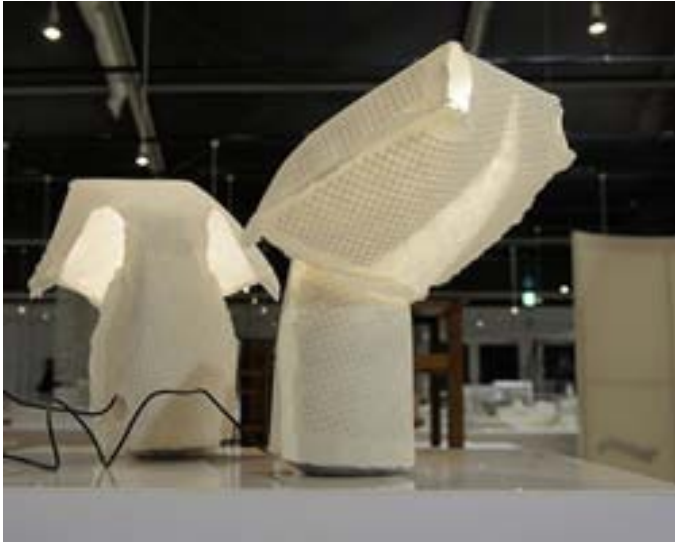
toshihito okura: albedo lamp

READER'S SUBMISSION the blow-up LED lamp collection reflects the aesthetic of a glowing moon with the use of a translucent material.