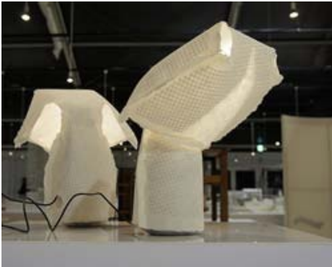
toshihito okura: albedo lamp

READER'S SUBMISSION the blow-up LED lamp collection reflects the aesthetic of a glowing moon with the use of a translucent material.