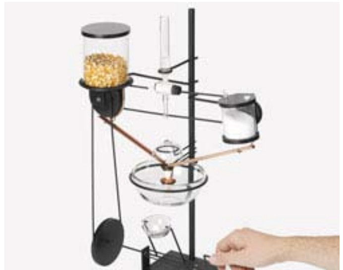
ECAL: oncle sam popcorn machin