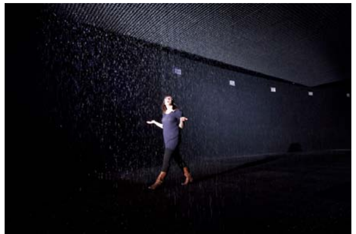
the rain room takes art lovers on a journey through a dark corridor surrounded by the sound of drumming rain