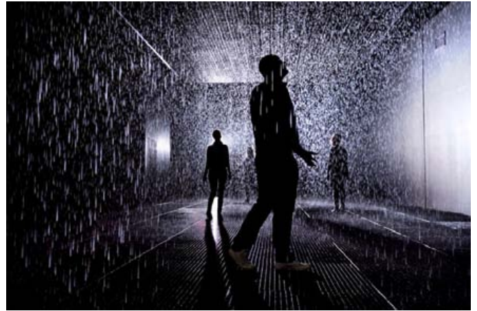
participants experiencing the sound of rain, without getting wet image © felix clay